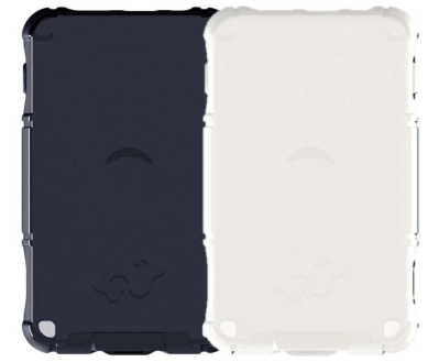
● Obsidian Black